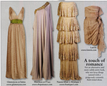
Glamonyou at Soiree www.glamonyou.com